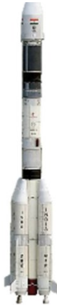
GSLV MK II