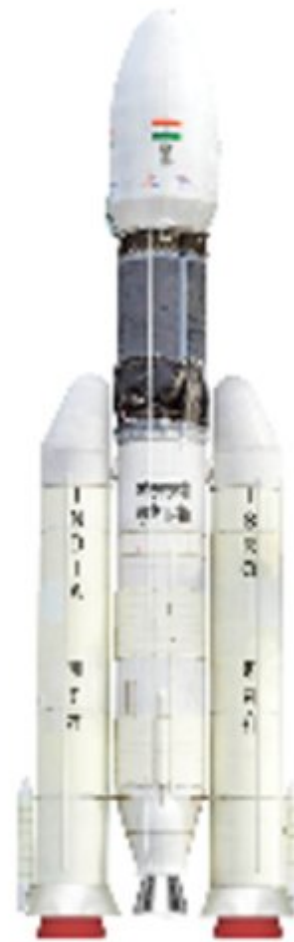
GSLV MK III

"Wow Ma that's awesome. And you know I am so happy today because I am going to FAIL!!! She laughed. Yes, I am going to make a model of a rocket for my science project and F.A.I.L. Ma, F.A.I.L. 8 stands for FIRST ATTEMPT IN LEARNING! That's what Dr. Abdul Kalam said too. Isn't that awesome!"